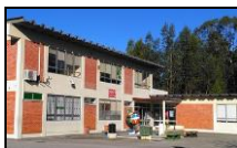
Escola Dr. Correia Alexandre AECSCS Portugal