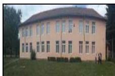
Liceul Tehnologic "Johannes Lebel" Talmaciu Romania