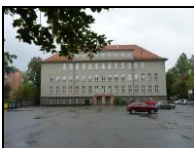
I Liceum Ogólnokształcące im. prof. Zbigniewa Religi in Zabrze Poland